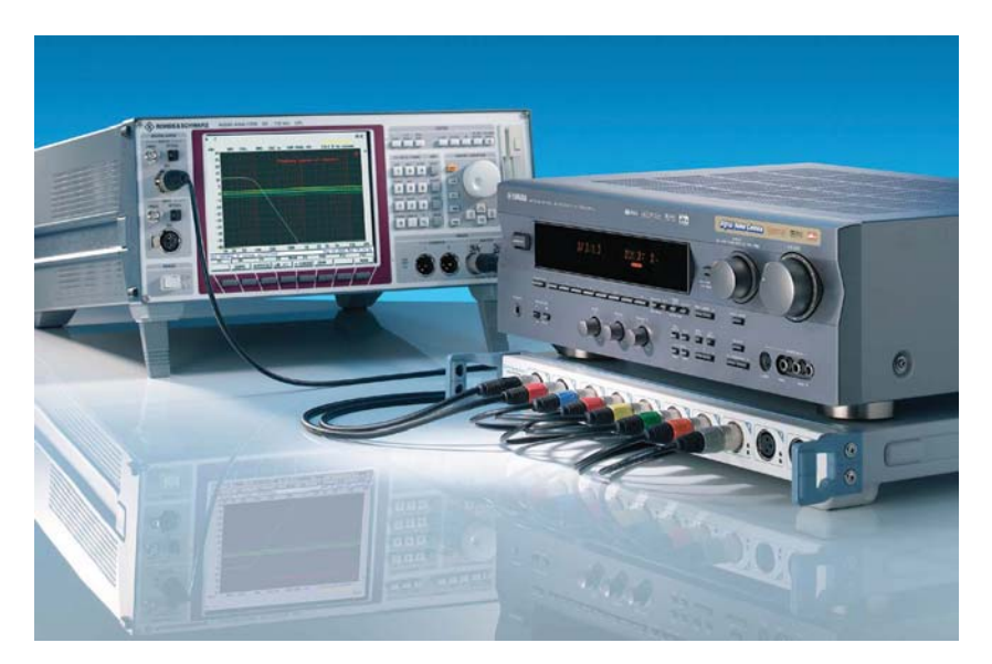
Multichannel measurements on audio/video receiver

The Audio Switcher R&S®UPZ can be operated not only via the R&S®UPL. Through its RS-232-C interface, it can also be controlled directly from other