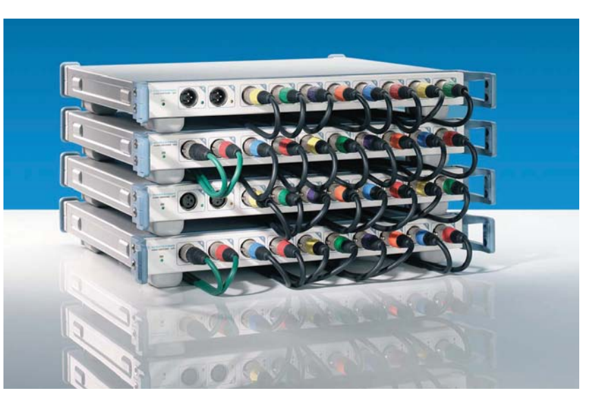
With the Audio Switcher R&S®UPZ, up to 128 input and 128 output channels can be cascaded

units or a controller. This opens up new possibilities; for instance, in broadcasting stations, where studio operations require the switching of several audio channels.